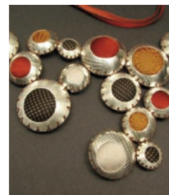
FRONT PAGE - TOP: Boutonnière. 2006. Brooch. Sterling Silver, Found Fabric, Cotton Thread, Spring Steel.

For more information about the brochure, please call 416-925-4222 and leave a message for the Volunteer Committee.